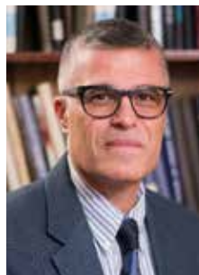
Prof. Atef Z. Elsherbeni

For FDTD simulation of nonlinear devices, our method has the following advantages. First, it is of lower computational complexity than some FDTD semiconductor models, which require iterative numeric solution of nonlinear equations. Second, it provides direct compatibility between